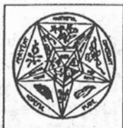
Order of the Eastern Star

hets of the Enchanted Realm, the women's Orders of the Easter Star, and of the White Shrine of Jerusalem, the girls' order of the Daughters of the Easter Star, the International Orders of Job's Daughters, and of the Rainbow, and the boys' Order of De Molay, and their effects on me and all my family.